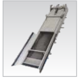
Screenmat Step Screen