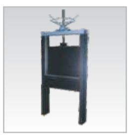
Downward Opening Weir Gates