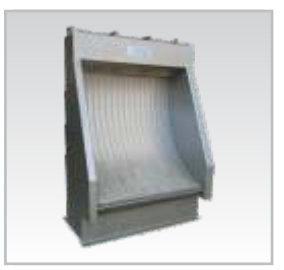
Hyperbole Static Screen