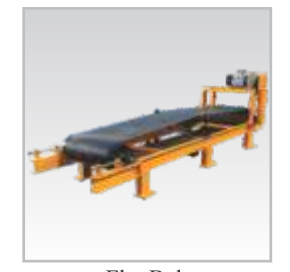
Flat Belt Conveyor