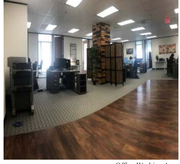
Office Entrance Office Working Area