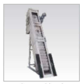
Mahr Maschinenbau Per-Scalator Filter Band Screen