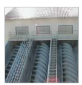
Archimedean Screw Pumps