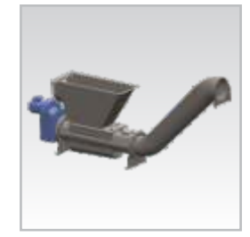
Jet Breaker Washer Compactor