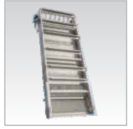
Mahr Maschinenbau mm2mm Multi-rake Screen