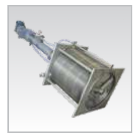
Rotoclean Rotary Drum Screen