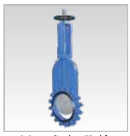
Mono Series Knife Gate Valve