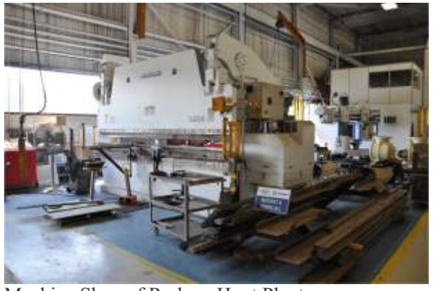
Machine Shop of Rodney Hunt Plant