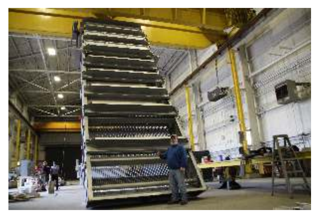
Multirake Bar Screen for Port Monmouth, Orange, USA

5. The Rodney Hunt plant at Orange, Massachusetts has commenced operations in August 2018 and the plant is now producing gates and screens. The first large screen manufactured for Port Monmouth, USA is displayed.