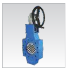
Energy Dissipating Valve