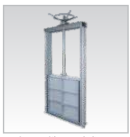
Open Channel Gates