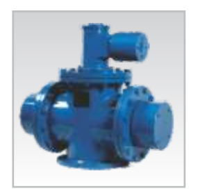
Air Cushion Valve