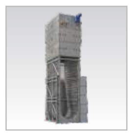
Travelling Band Screen