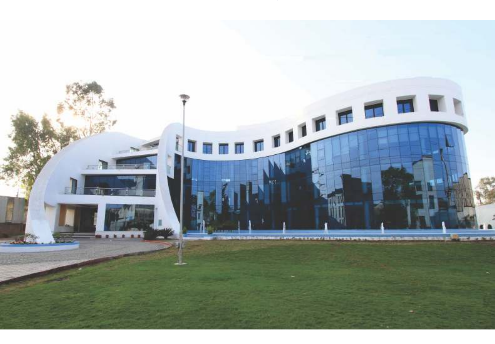
Contributing to a sustainable environment