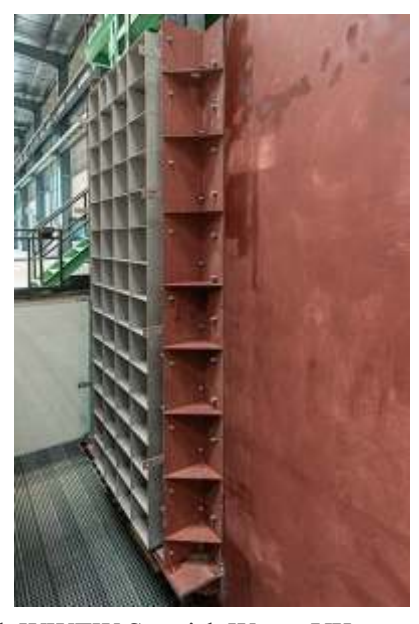
Open Channel Gate for Dalmarnock WWTW Scottish Water, UK