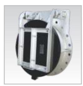
Flap Gates / Automatic Drainage Gates