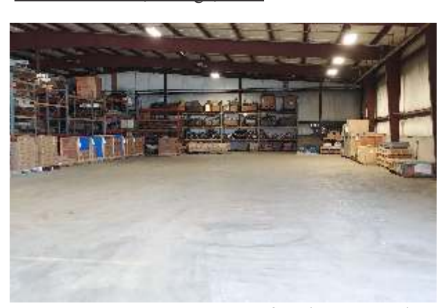
Storage Area of Rodney Hunt Plant

6. A new corporate office of Rodney Hunt Inc. at 6200 Savoy Dr Ste 750, Houston, TX 77036 USA was opened in July 2019. This office is large enough to accommodate 20 people and should serve our needs till the company touches USD 25 million in sales.